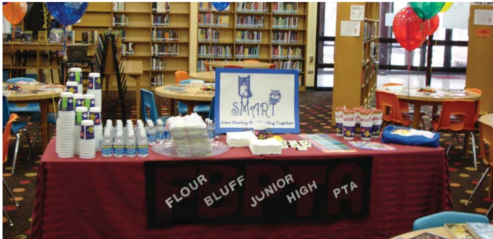
Flour Bluff Junior High PTA collected more than 200 books for their first SMART book swap. Books were collected in bins decorated by students in the art department.

We had an amazing time Monday, May 11 at Flour Bluff Junior High School when we held our first SMART book trade. Since Flour Bluff is in a Chapter 1 district, instead of collecting books for donation, we collected books to be given back to our students.